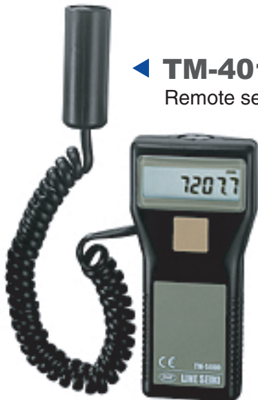
◀ TM-4015 Remote sensor