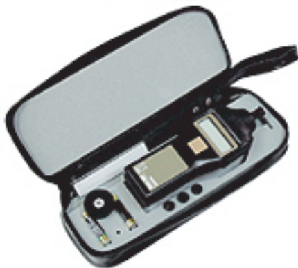
▲ TM-5000 0.1 rpm resolution